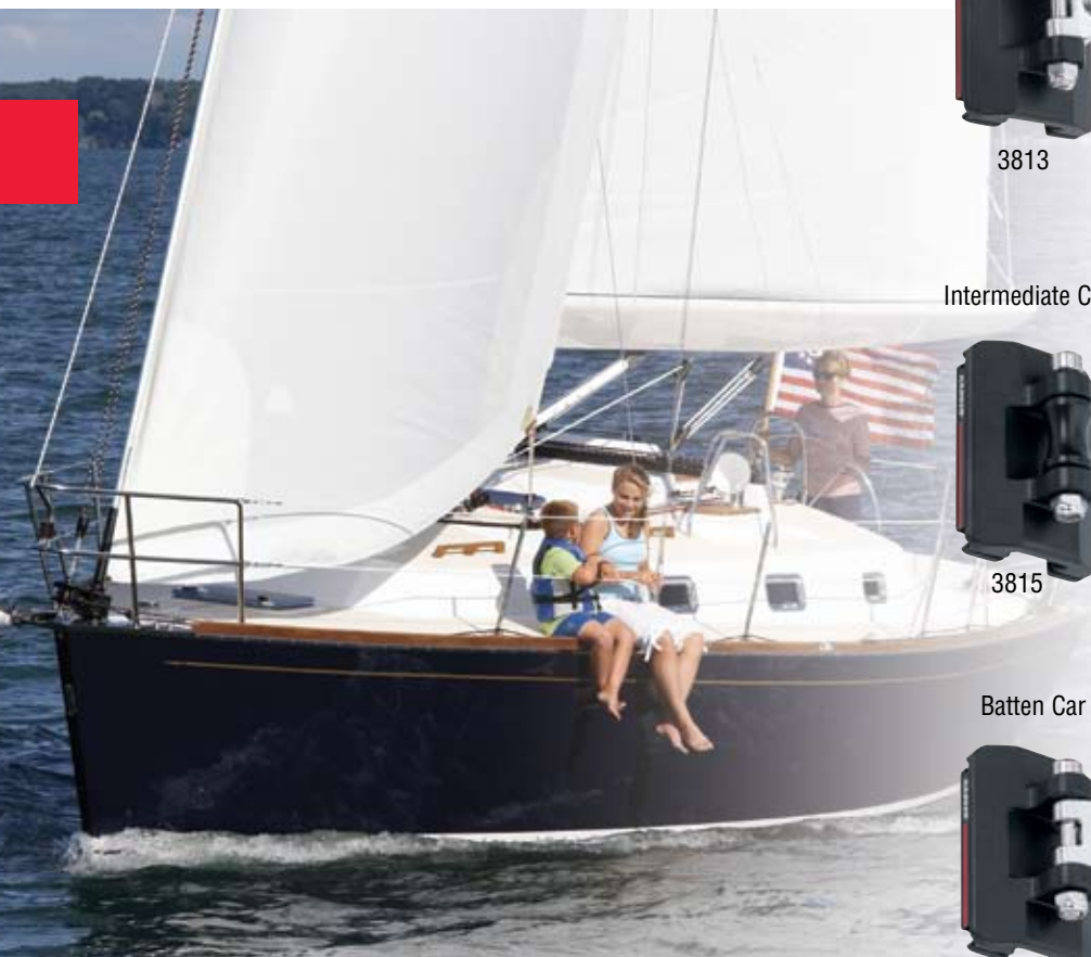
Tartan 3400

Threaded stud and toggle design handles twisting and angled loads for quick hoisting and dousing